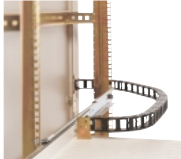
Cable Guide for Telescopic Shelves (RMESC707).