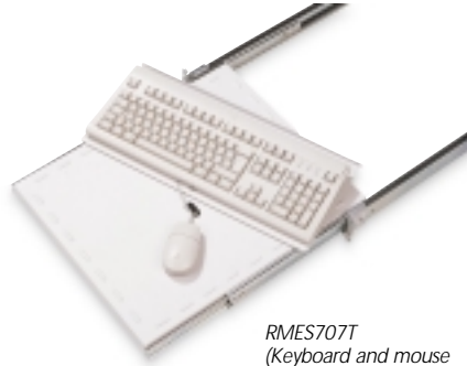
RMES707T (Keyboard and mouse are not included)