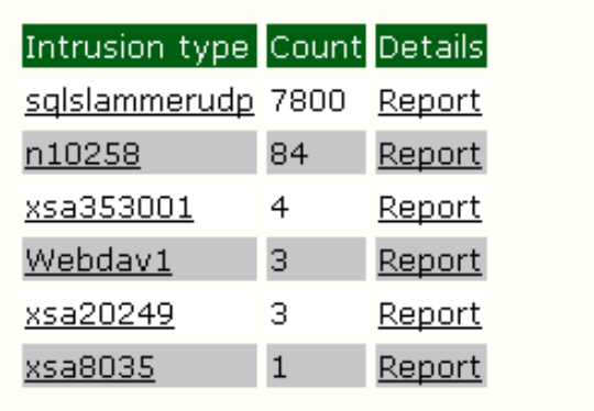
row 1 to 6 of 6

The interface creates easy to use reports that can be explored and displayed in a number of different ways.